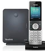
Yealink DECT Cordless