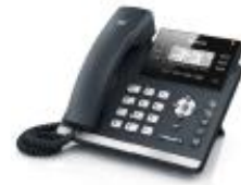
Yealink T4 series